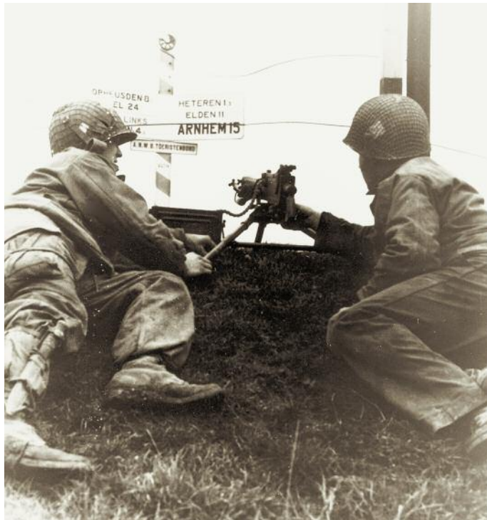
Above, left: A D-Day assault on German guns was Winters's first combat, but not his last. Here, Easy Company troopers man a machine gun in October 1944 in the section of Holland called the Island. Winters's unit was there as part of an effort to penetrate Germany via Holland. Above, right: Easy Company loads up for Bastogne, Belgium, in December 1944, to help withstand a German siege during the Battle of the Bulge.

Winters always regarded the attack at Brecourt Manor as one of the highlights of his tenure in company command. Correspondent Ernie Pyle wrote that the “first pioneering days of anything are always the best days.” Though Winters would experience many harrowing battles in the future, Brecourt remained special to him because it was his first battle, and he measured up to his personal standard of leadership and to the expectations of his soldiers. The successful assault validated the months of prepa-