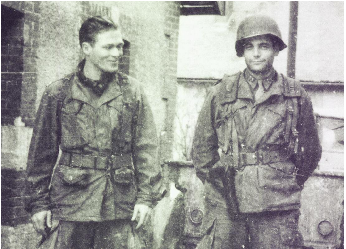
Above: An enduring friendship helped Winters deal with the stress of war. Captain Lewis Nixon (right), an Easy Company and later 2nd Battalion operations officer with a taste for whiskey and a wicked sense of humor, couldn't have been more different than the serious-minded, ever-sober Winters. The two men would witness the war together, and remain lifelong friends. Opposite: Winters as a lieutenant.

Without hesitation, Winters called for fire to stem their attack. One Easy Company paratrooper likened the battle to a “duck shoot” with the retreating Germans running for their lives to the safety of the river.