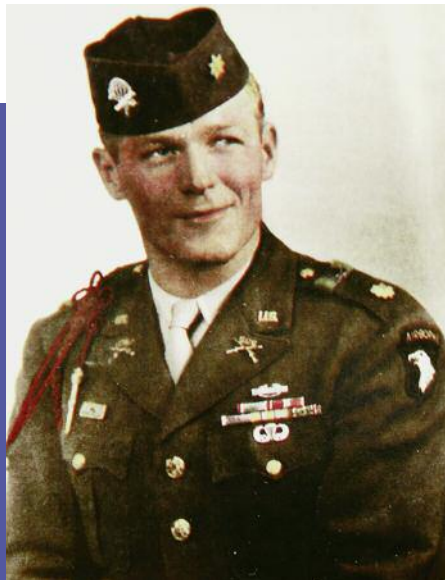
Above: In 1945, Winters wears the decorations that tell his war story. Top: Stephen Ambrose made that story famous in 1992.

West Point taught the mission to cadets for decades to come.