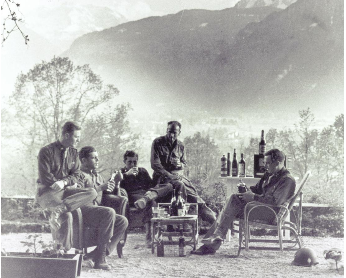
At Adolf Hitler's retreat at Berchtesgaden, Germany, Winters (far left) and officers of his 2nd Battalion of the 506th Parachute Infantry enjoy libations from the führer's own cabinets. Capturing the Nazi leader's luxurious mountain home was a welcome reward for Winters's men.

that he had promised himself if he survived World War II. A highly successful businessman who marketed a line of nutritional products for animals, Winters eventually retired near Hershey, Pennsylvania. He spent the remainder of his life championing charitable causes and promoting educational reform.