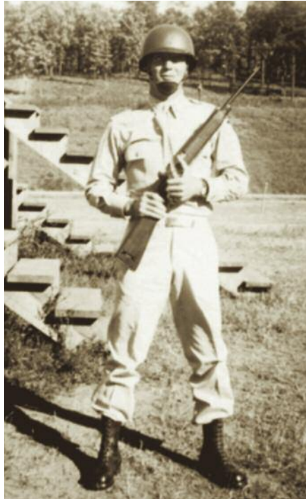
Above: Winters wears an M1C paratrooper's helmet and totes an M-1 carbine at Camp Toombs near Toccoa, Georgia, where he received airborne training. Below: Men of the 506th Parachute Infantry head for their transport planes on June 5, 1944, to jump into France in the wee hours of D-Day—the day Winters saw his first action.

Conducting a hasty reconnaissance, Winters issued orders for the assault, which would consist of him and another officer leading the main charge while other Easy Company troopers provided supporting fire. In Winters's words, the keys to this “high risk assault” were “initiative, an immediate appraisal of the situation, the use of terrain to get into the connecting trench, and taking one gun at a time.” Less than three hours