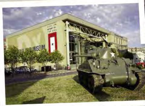
The National World War II Museum New Orleans, Louisiana birthplace of the Higgins boat