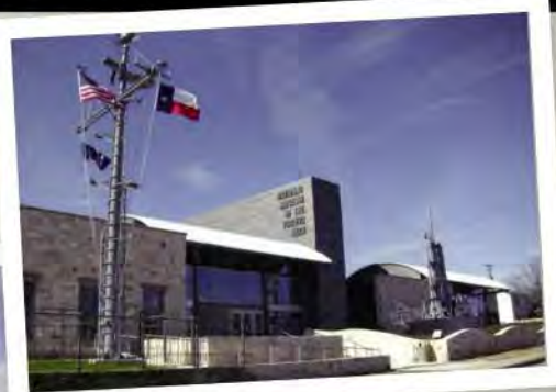
The National Museum of the Pacific War Fredericksburg, Texas birthplace of Fleet Admiral Chester Nimitz