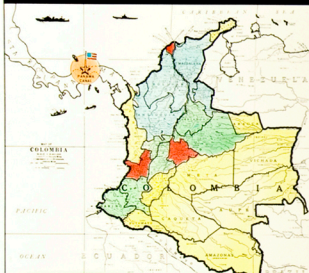
1940 CENSUS OF FOREIGN-BORN TOTAL IN EACH DEPARTMENT